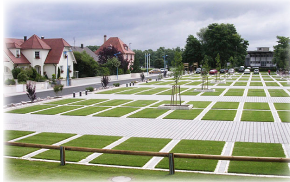
Sales Representative ...

Our ECORASTER® Porous Pavement Systems are functional, durable, environmentally safe, as well as aesthetically pleasing to the surrounding landscape. We encourage each customer to participate and personalize in their project.